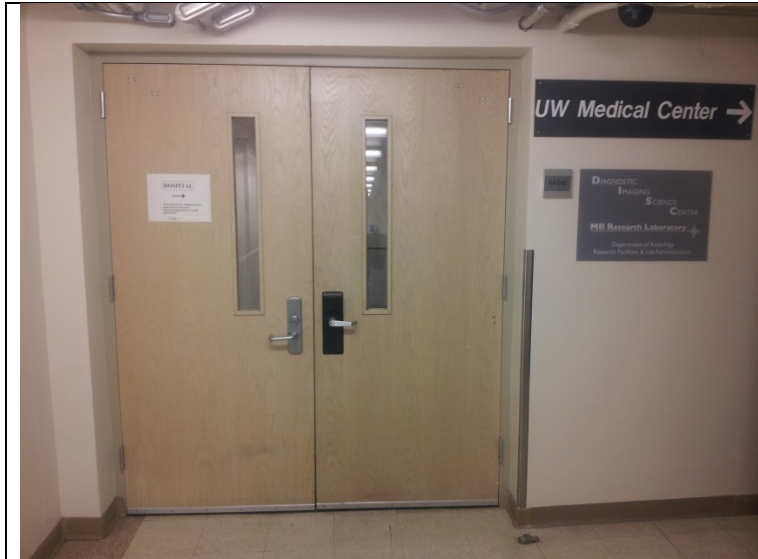
Enter the doors.