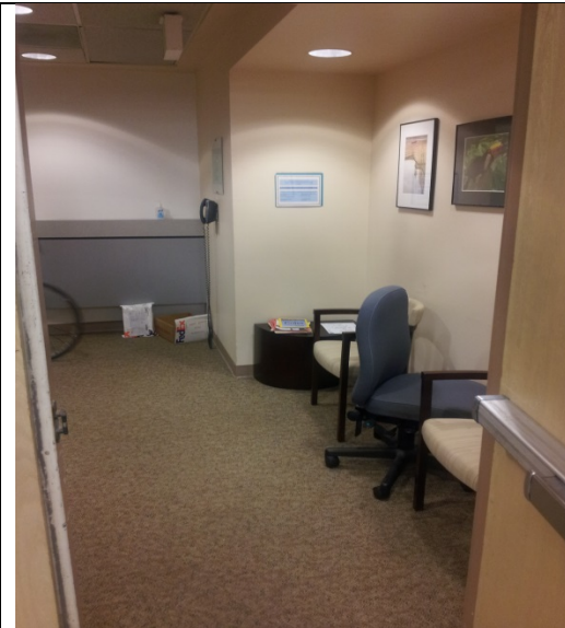
Welcome to the Diagnostic Imaging Science Center.